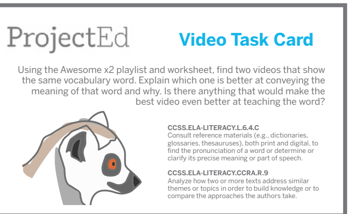
Sample Project Ed VTC and Rubric